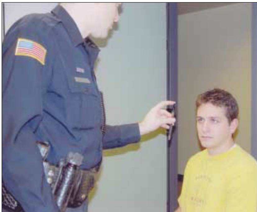
Figure 1 Demonstration of Horizontal Gaze Nystagmus test in seated posture.

All subjects were of legal drinking age and acknowledged varying levels of experience with drinking alcohol. None of the subjects reported fatigue, presence of any health conditions, or use of any medications that precluded participation in the study. Three subjects at two workshops were unable to complete the testing; nonetheless, their data for the portions completed are included in the analyses we discuss here.